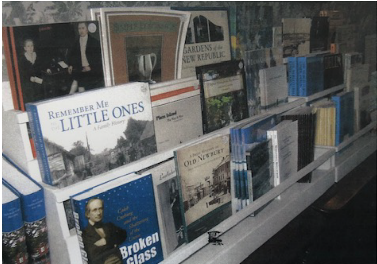
REMEMBER ME TO THE LITTLE ONES BY NANCY KRAVETZ FEATURED AT THE HISTORICAL SOCIETY OF OLD NEWBURY NEWBURYPORT, MASSACHUSETTS, FALL 2010